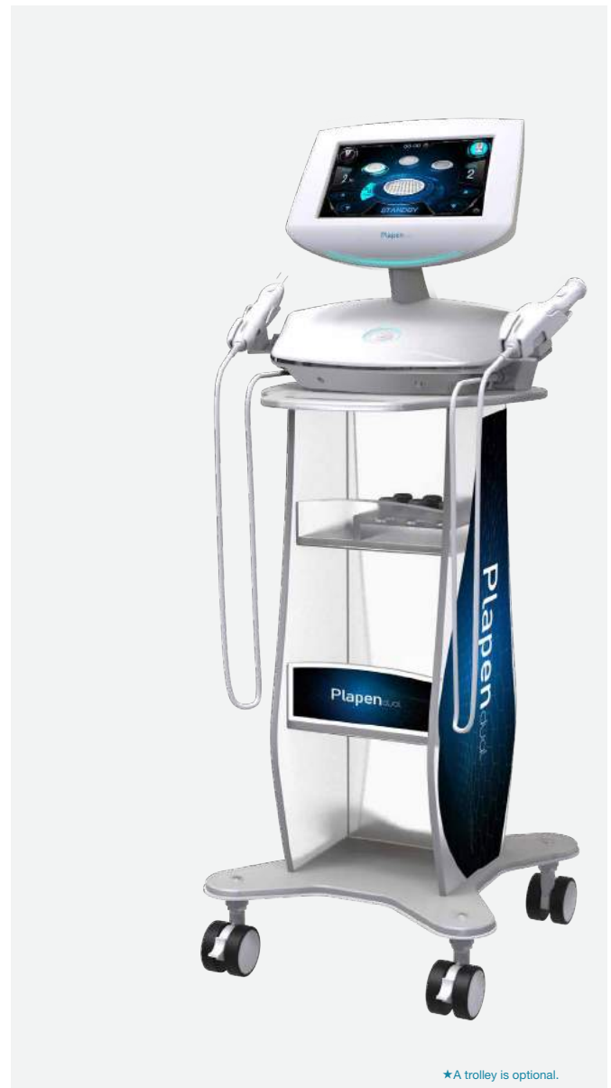
★ A trolley is optional.